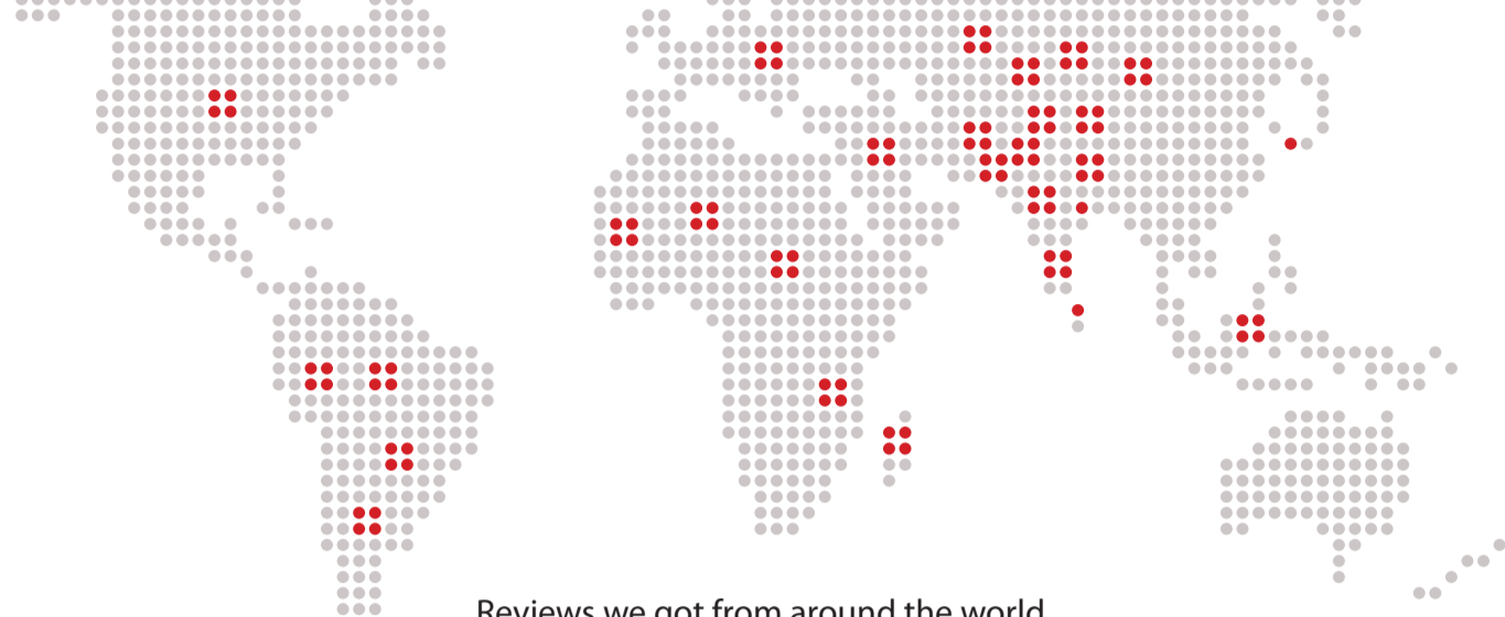
Reviews we got from around the world

InstaHot is a revolutionary convenient and lightweight outdoor flameless food heater that makes easy to have hot food at any place and any time that is why it is used all around the globe.